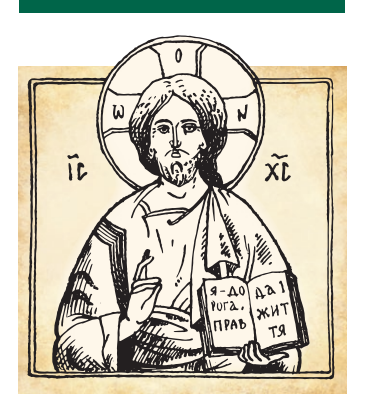
First Day: Friday Gospel of John 14:1–11