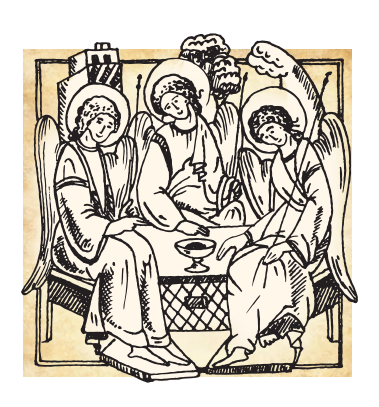
Second Day: Saturday Gospel of John 14:10–21