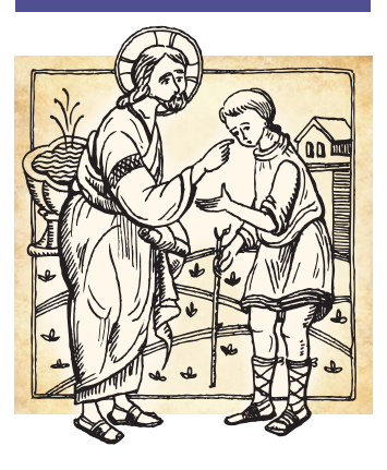
Seventh Day: Thursday Gospel of John 16:23–33