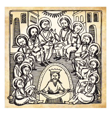
Fifth Day: Tuesday Gospel of John 16:2–13