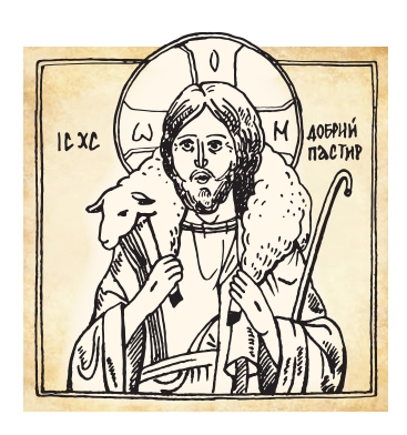
Ninth Day: Saturday Gospel of John 21:15–25