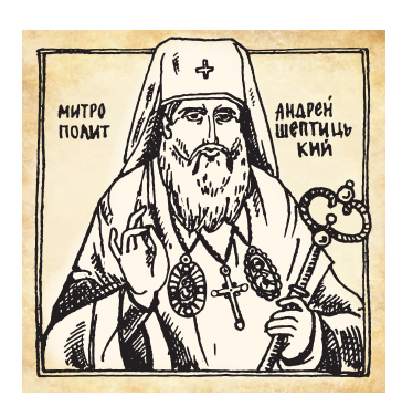
Eighth Day: Friday Gospel of John 17:18–24